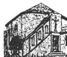
Holy Family Church Bewdley

Part of the Archdiocese of Birmingham Reg Charity No 234216