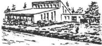
St. Wulstan & St. Thomas of Canterbury Stourport on Severn

The Holy Family Church High Street, Bewdley