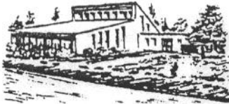
St. Wulstans & St. Thomas of Canterbury Stourport on Severn

The Holy Family Church High Street, Bewdley